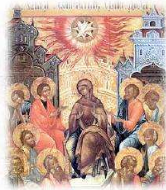
Russian Orthodox Icon of Pentecost.