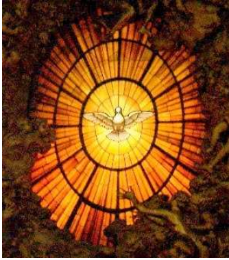
Holy Spirit window St. Peter's Basilica, Rome

Please make note of the following dates for assignments. The color noted in the parentheses refers to the section of the binder where you will find assignment guidelines and necessary forms.